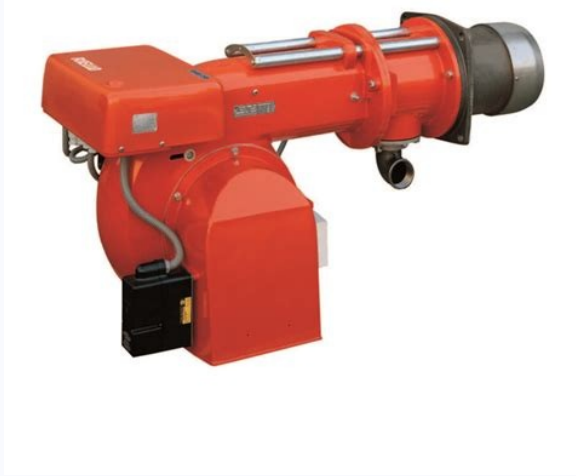
Fig. Tab "section". Table d d